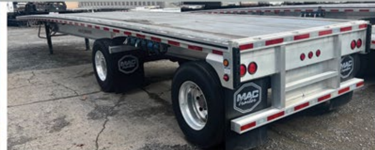
Qty 2 – 2022 MAC Road Warrior, 48'x102". (Pictured) 2017 MAC, 48'x102", Winch Track w/Winches, Alum Wheels. Selling Price $29,995 Unit # 6182