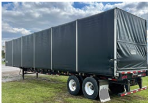
Qty 2 – 2016 Transcraft Flatbed, 48'x102", A/R Sliding Tandem. Unit #'s 6310,6311