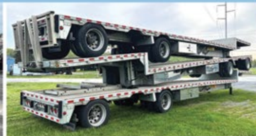
Qty 32 – 2018, 2016, 2015 Reitnouer Dromiser's, 48'x102", Rear Axle Slide, Winch Track Both Sides, (3) Toolboxes, New DOT INSP. Starting at $39,900