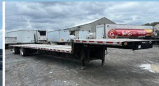
Qty 3 – 2014 Fontaine Combo Drop Decks, 53'x102", Rear Axle Slide, w/20' & 40' Container Locks, Fresh DOT INSP. $27,950