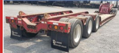
2019 Fontaine Magnitude 55L Plus, 26' in the Well. Unit # 6111