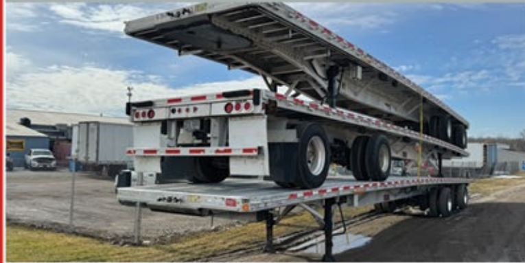
Qty 30 – 2018 Reitnouer Maxmiser, 53'x102", Rear Axle Slide, Front Axle Lift.