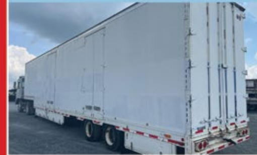
Qty 3 – 2014 Fontaine Combo Drop Decks, 2004 Kentucky Moving Van, 53'x102"x13'6", (6) Side Doors, New Alum Roof, New DOT INSP. Unit # 6364