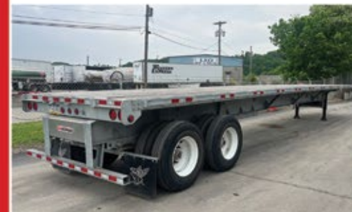
2017-2022 Manac Extendable Flatbeds (Galvanized & Painted), 48'102"-80' & 53'x102"-90' (Tandems and Tri Axles).