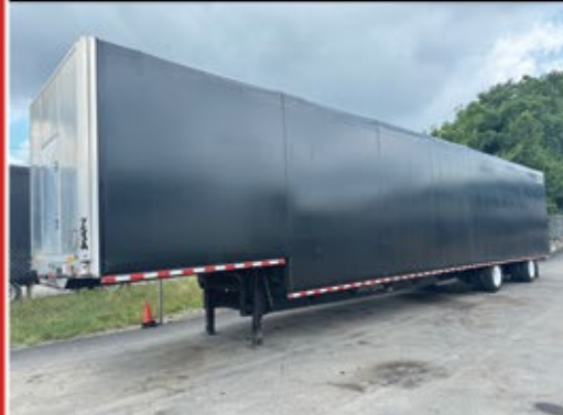
2023 Wabash, 53'x102", D-Eagle Drop Deck, Rear Axle Slide, Fastrak Kit. Unit # 6726