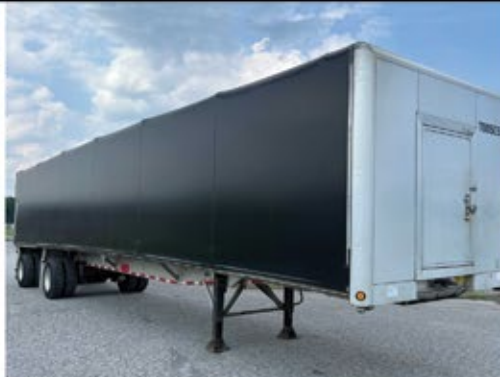
2012 Reitnouer Maxmiser, 48'x102", w/Quick Draw System. Unit # 6530