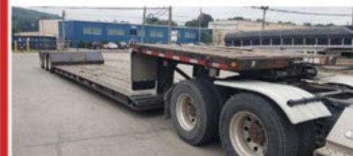
2009 Fontaine Double Drop, 29' in the Well. Unit # 6175