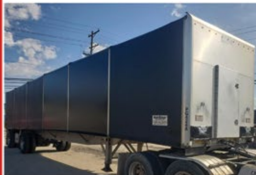
2018 Reitnouer Bubba, 48'x102", w/Merlot System, (1) Toolbox, Winch Track w/Winches. Unit # 6380