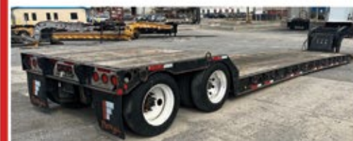
2010 Fontaine Renegade N20, 29' in the Well. Unit # 5612