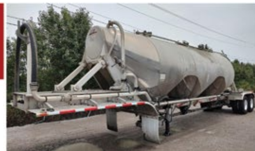
2020 Heil 1040 Tank, New Brakes & Drums, New DOT INSP. Unit # 6202